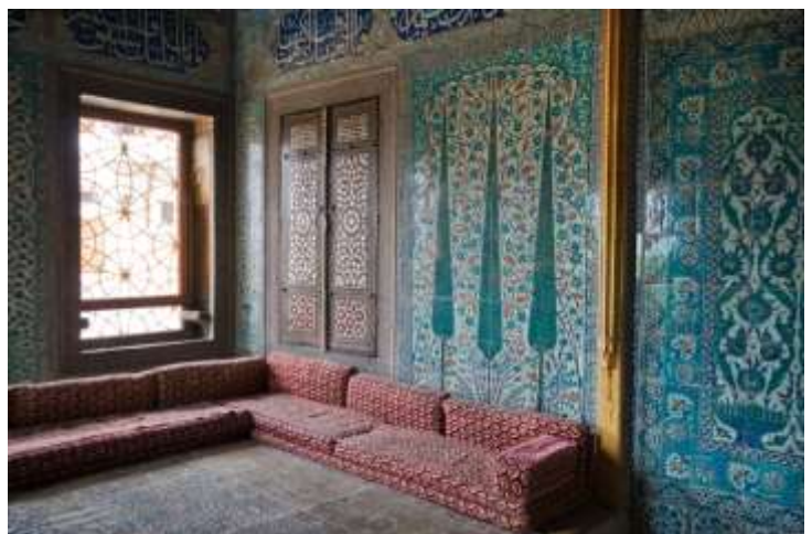
'Golden Cage'. Topkapi Palace

Palace Layout Exterior, Imperial Gate Court of Processions Second Court, Divan, Kitchens Gate of Felicity Third Court Throne Room Library, Holy Relics Fourth Court, Kiosks Harem Tour Tower of the Law